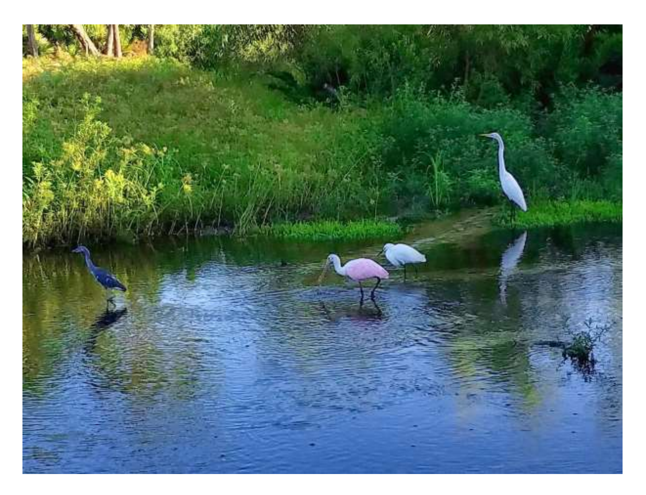
Wildlife enjoying the benefit of a healthy stormwater system....